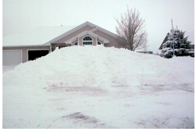
Street view of 430 E Main Street after the snow was cleared

To those who didn't move your vehicles, we have to wonder "WHY?". The guys cannot get to the curbs if there are vehicles blocking the way.